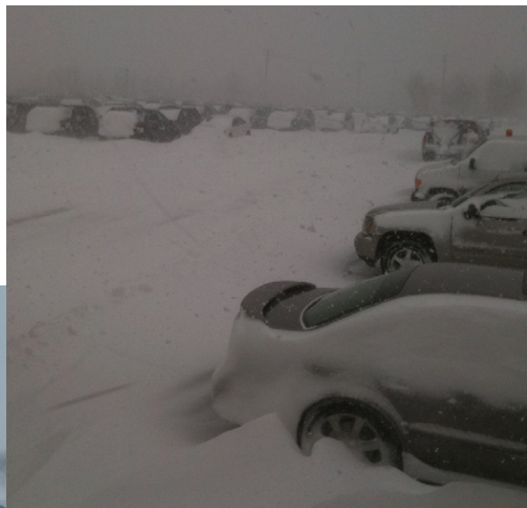
Above: the view at the Chicago Ford facility